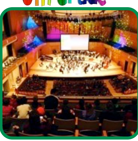
The 5th graders learned about the science of sound at the Omaha Symphony.